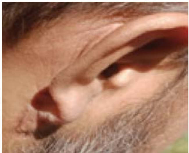
Figure 4: Post-operative follow-up.

released from surrounding parotid region, it was excised (Figure 3) and sent for histopathology. Layered closure was done. A drain was placed for 24 hrs. Facial nerve examination was done, the nerve was concluded to be functional post-operatively. Mild pain was relieved with analgesics. Patient was regularly followed up. (Figure 4)