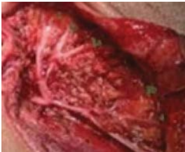
Figure 2: Branches of the Facial nerve.