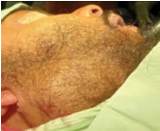
Figure 1: Swelling on the right side of the face.